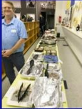
Winternational Potluck 2018