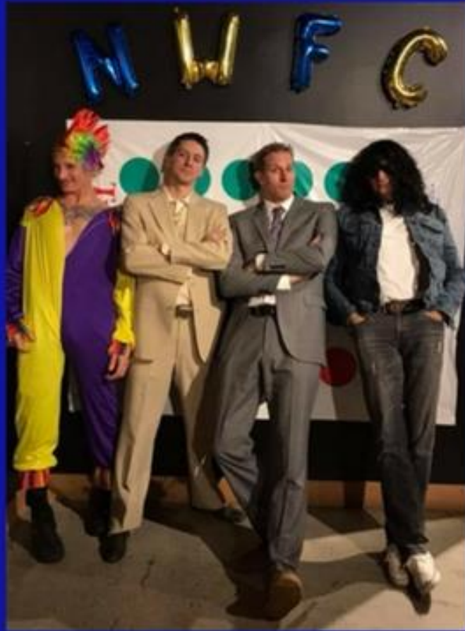
That 70's Party 2017