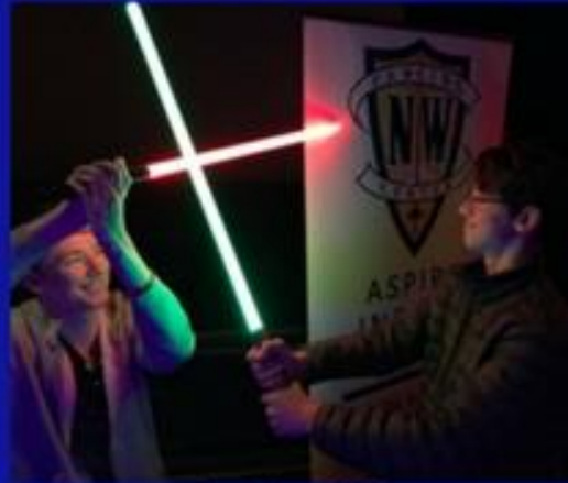
Star Wars 2017